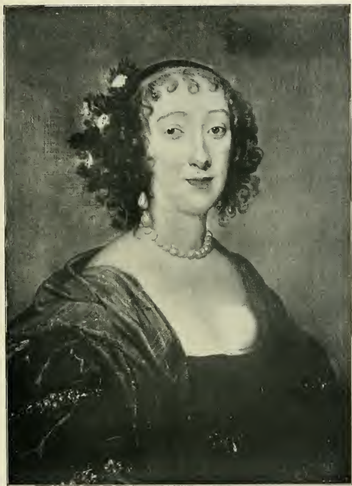
DOROTHY, COUNTESS OF LEICESTER.